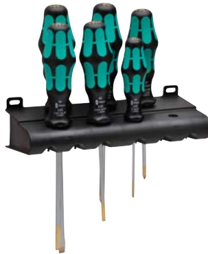
Standard, Insulated and Miniature screwdrivers available in 6-piece sets with a wall mount rack included.