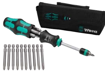
Bit Drivers and Screwdriver Bits