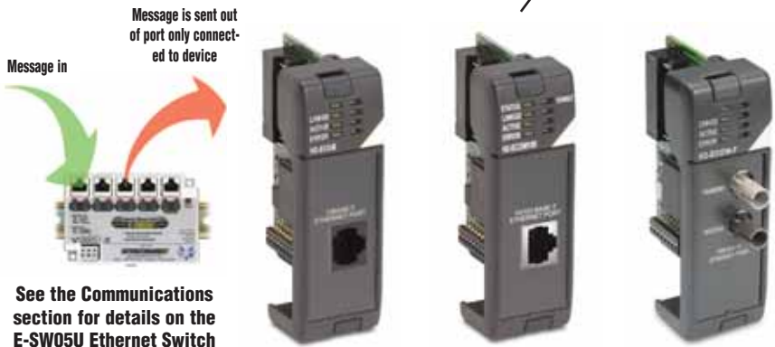
See the Communications section for details on the E-SW05U Ethernet Switch

The H2-ECOM100 supports the Industry Standard Modbus TCP Client/Server Protocol