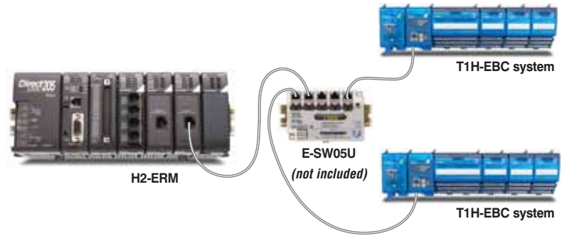
Example of an Ethernet remote I/O system using a T12-ERKIT-2. CPU, bases, I/O modules, Ethernet hub, etc. are sold separately.

A T12-ERKIT-2, shown below, includes one H2-ERM and two T1H-EBC modules. All other necessary hardware, including the CPU, I/O modules, bases, cables and Ethernet hub (if required), is sold separately.