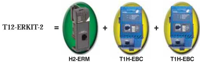
Example kit: T12-ERKIT-2 includes one H2-ERM and two T1H-EBCs.